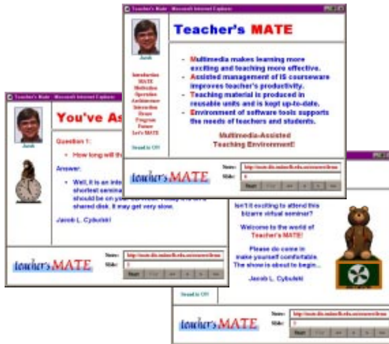
Figure 3 - Student's perspective of Teacher's MATE

As part of the Teacher's MATE project, we developed a prototype tool that allows teachers to record, organise and cross-reference sound, video, animation, text and graphics. The system also helps teachers in the planning and delivering of fully interactive lectures and tutorials to a large number of simultaneous student users on the web. With the aid of Teacher's MATE, students are able to work alone (off-line or on-line), in small teams or under the direct instruction and supervision of their teacher. Teachers are also more effective as they are equipped with tools capable of browsing, searching, retrieving and presenting vast volumes of teaching material stored locally on student machines and the web.