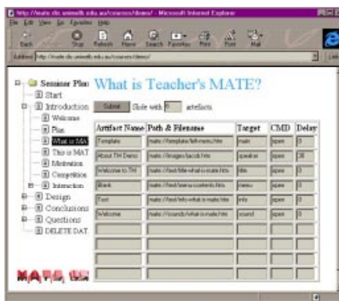
Figure 4 - Presenter's perspective of Teacher's MATE

In a typical course of events (Cf. Figure 1), teachers produce multimedia material using existing web-compatible authoring tools (e.g. drawing and painting packages, HTML editors, sound and video recording software, animation packages). Each multimedia artefact is then classified and subsequently added to the Teacher's MATE repository of multimedia components (Cf. Figure 2). Having a rich collection of reusable components, teachers use them to compose and structure multimedia slides, lectures and courses. A course can then be exported to CD-ROM in a form compatible with a number of commercially available